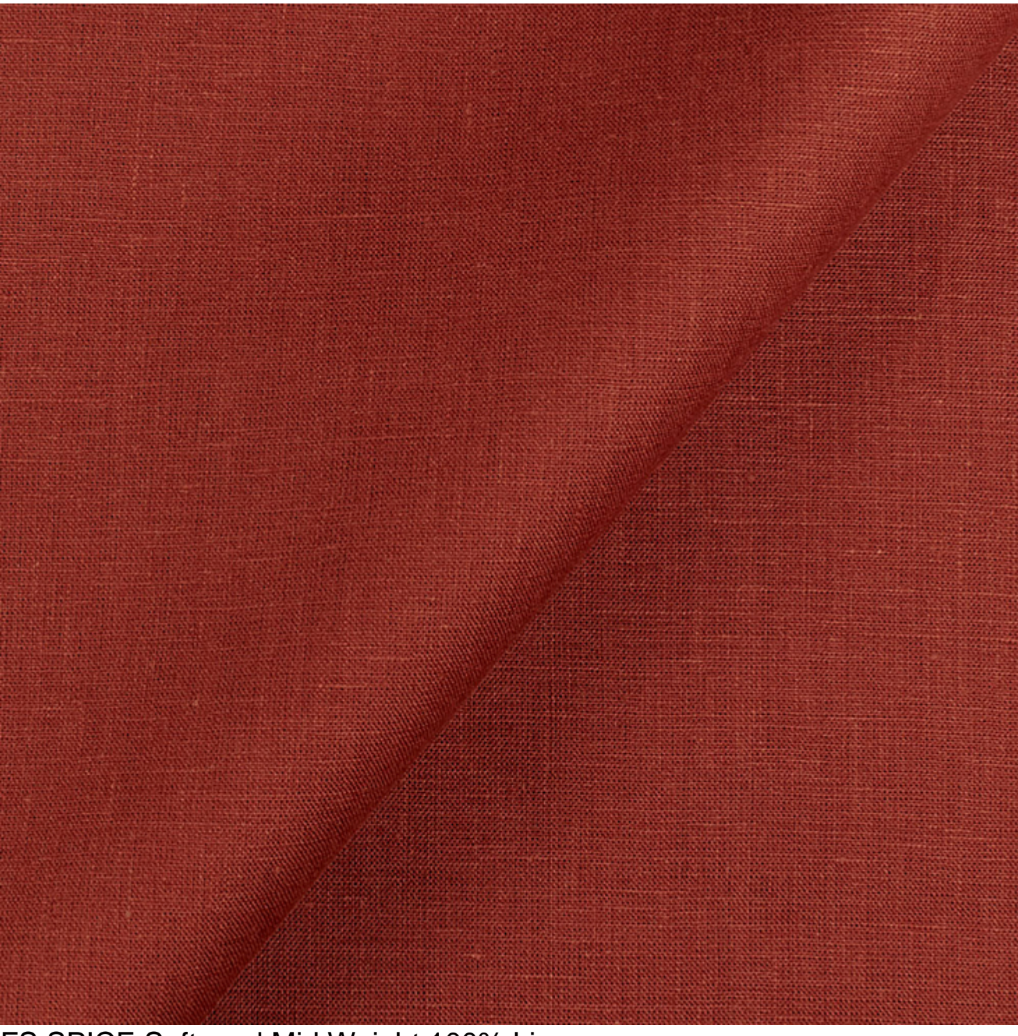
FS SPICE Softened Mid Weight 100% Linen